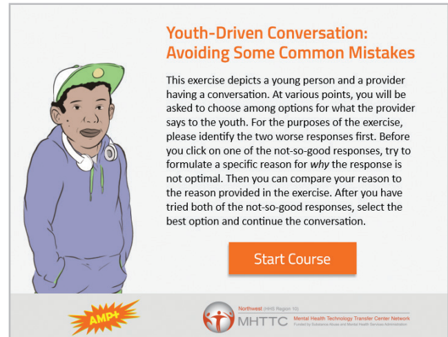
Screenshot from e-module

Regardless of a provider's intentions, young people will pick up on the subtle messages behind leading questions, suggestions, or advice from providers. When a provider makes a suggestion instead of giving a young person the space to develop their own ideas, the young person may get the impression that their voice is not valued or that the provider sees them as incapable of formulating their own solutions.