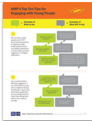
AMP's Top Ten Tips for Engaging with Young People (09/2016)