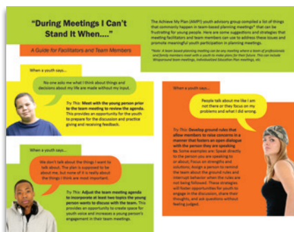
"During Meetings I Can't Stand it When..." A Guide for Facilitators and Team Members (11/2013)